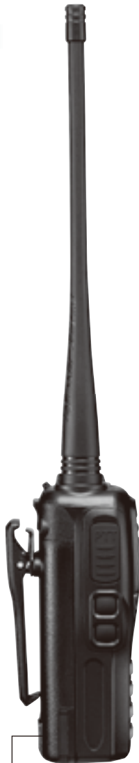
shown with EBP-87

5 : Dust protected /Ingress of dust is not entirely prevented, but it must not enter in sufficient quantity to interfere with the satisfactory operation of the equipment; complete protection against contact 4: Splashing water / Water splashing against the enclosure from any direction shall have no harmful effect. Test duration: 5 minutes / Water volume: 10 litres per minute /Pressure: 80-100 kN/m 2